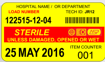
CATALOG NUMBER: L51-A55EY SYNTHETIC