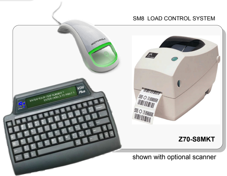
SM8 LOAD CONTROL SYSTEM

contact us at 1.800.679.7836 fax: 813-972-0578 - www.S1Medical.com