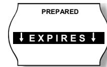
Cat. No.: L22-1004