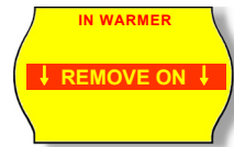
Cat. No.: L22-1018Y