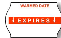
Cat. No.: L22-1017