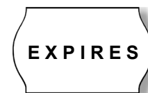
Cat. No.: L22-1001