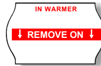
Cat. No.: L22-1018W