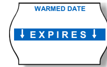
Cat. No.: L22-1023